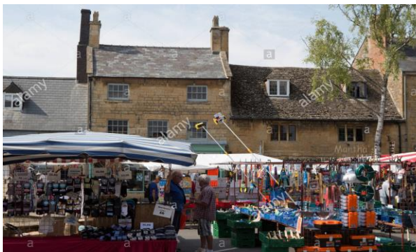
Moreton Market on Tuesday

The White Hart (Royal) Hotel was used by King Charles I as shelter during the English Civil War following the Battle of Marston Moor on July 2, 1644. A copy of the King's unpaid bill is commemorated on a plaque within the entrance lobby.