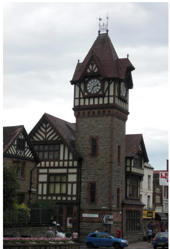
The Town Clock