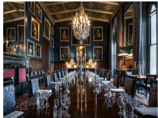
The State Dining Room