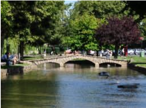
Through the Village