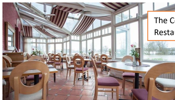
The Conservatory Restaurant