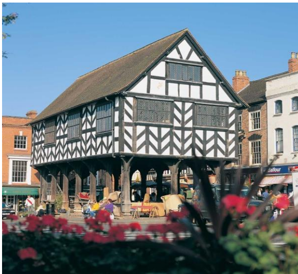
The Market House